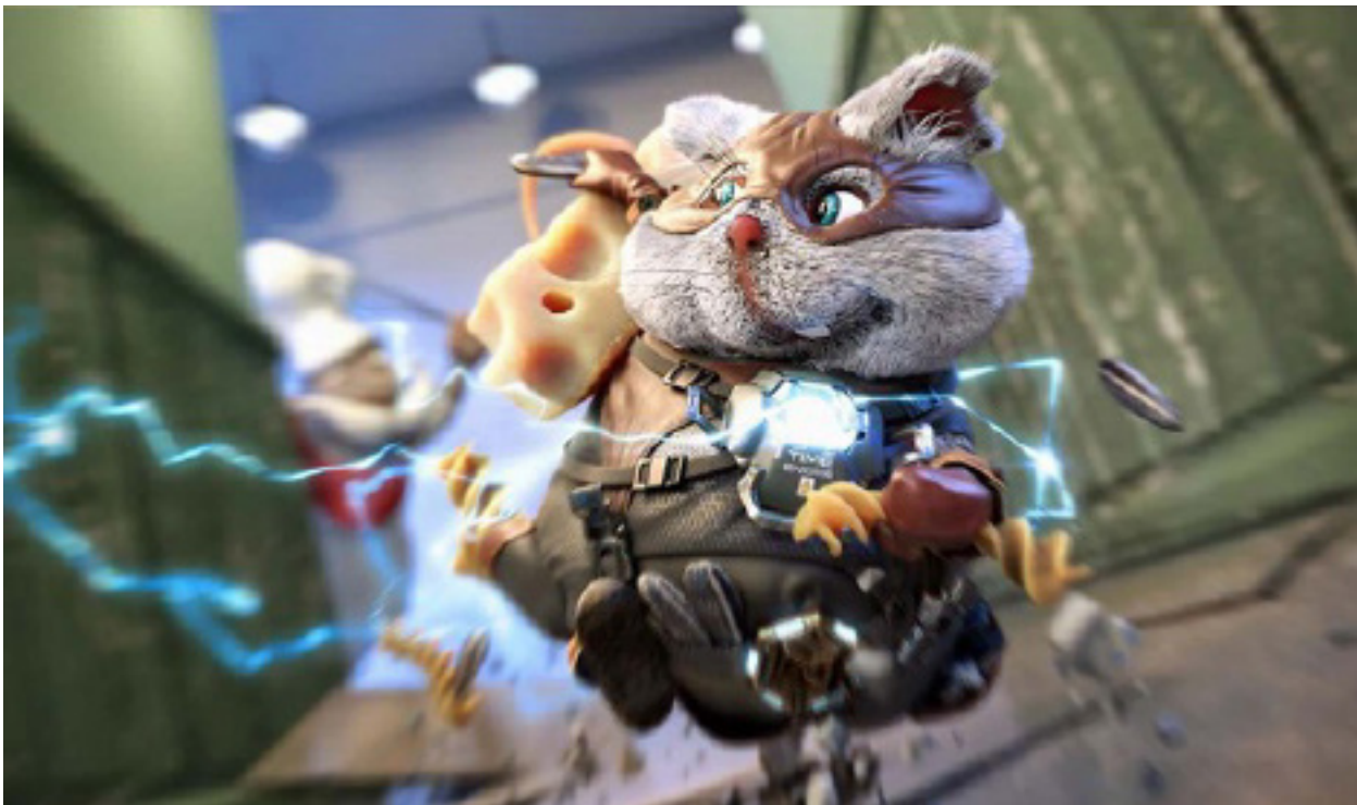
Table 1: Primary specifications of AMD Ryzen Threadripper PRO 7000 WX-Series workstation CPUs

Clever processor engineering can mitigate performance penalties to some degree, but bottlenecks like these can ultimately be remedied only by a hefty dose of brute force – lots of processing cores, abundant cache, memory, and bandwidth, and no-compromise clock frequencies. With a family that scales from 12 to a bar-raising 96 cores, coupled with up to 2 TB of memory accessed by eight DDR5-5600 channels and boasting more bandwidth and L3 cache than any single-socket workstation CPU available in the industry, the AMD Ryzen™ Threadripper™ PRO 7000 WX-Series delivers on all fronts.