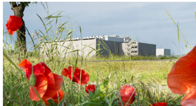
Deutsche Telekom data centers advance sustainability with AMD EPYC Server CPUs and dynamic energy scaling.